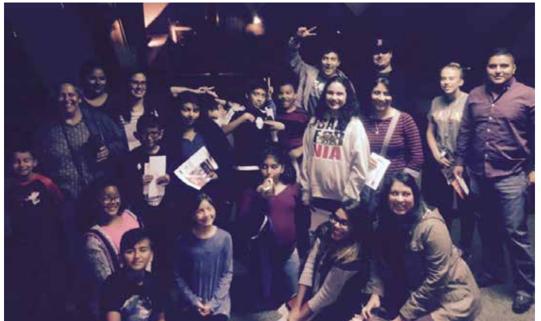
Above, members of CORE Kids, Youth and their families getting ready to see, "For King & Country" in concert.