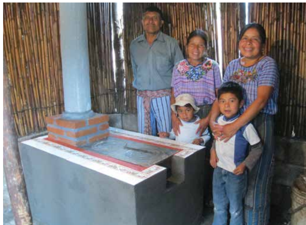
This new stove will make a tremendous difference in the quality of life for this family.

The next mission team to Guatemala will leave in November. Some of these team members will be going to Chichicastenango where the Methodist Church of Guatemala is headquartered. They, along with one of our master stove builders, will be training two new stove