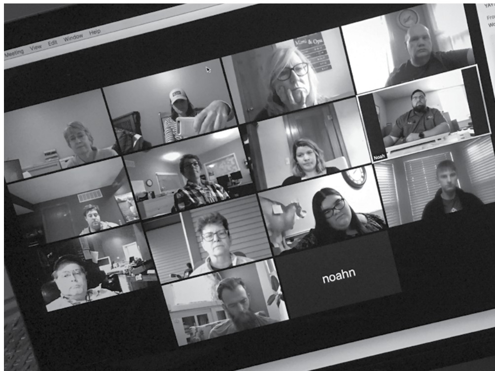
The First Church staff as well as other groups and committees, continue to meet virtual through Zoom.

When we do meet again in person, we will need to have in place extra pre-cautions to honor and protect our most vulnerable. The bishop states it like this: