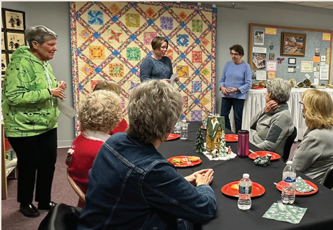
First Church Quilters gathered together for a luncheon to celebrate another successful Quilts, Etc. Sale.

At a Christmas luncheon this December, the quilters presented checks from the proceeds of their Quilts, Etc. Sale to the Religious Nurture Center and Television Ministry, totaling $18,500! Thank you to everyone that helped make this event a success. And a special thank you to the First Church Quilters for using their creativity and talents to support the ministries of First Church! Check out their blog at https://quiltersatfirst.com for items that can be purchased all year long!