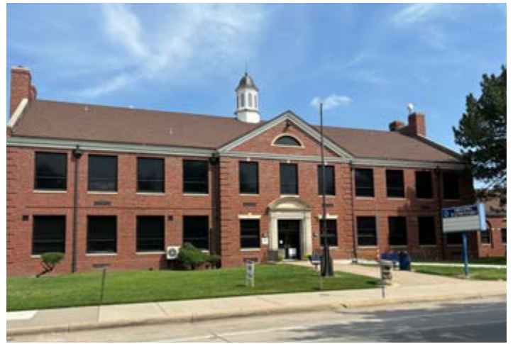
Irving Elementary, 1642 N. Market

to distribute to children in need. Another First Church volunteer spent several afternoons helping the music teacher unpack and store her vast collection of musical instruments. The music teacher is one of 7 Park staff who moved to Irving. The school has a total of 16 staff new to that building.