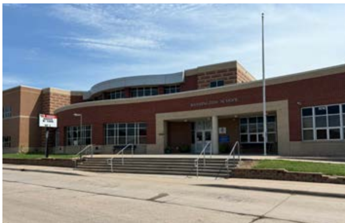
Washington Elementary, 424 N. Pennsylvania

In August, several First Church volunteers spent a few hours sorting clothing which our church had purchased for Park students and had been sent on to Irving. Clothes are organized by size and season and are ready for the social worker